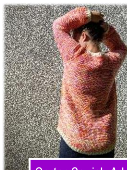
Garter Squish Adult

Why not check out the other Garter Squish patterns?